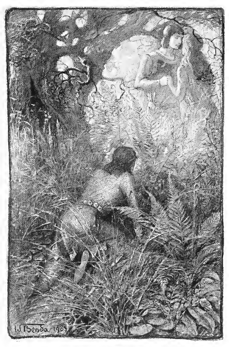
"LIFTED HIS HEAD SLOWLY ABOVE THE SWEEP OF GREEN"